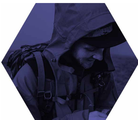
Christian McLeod Adventure Photographer